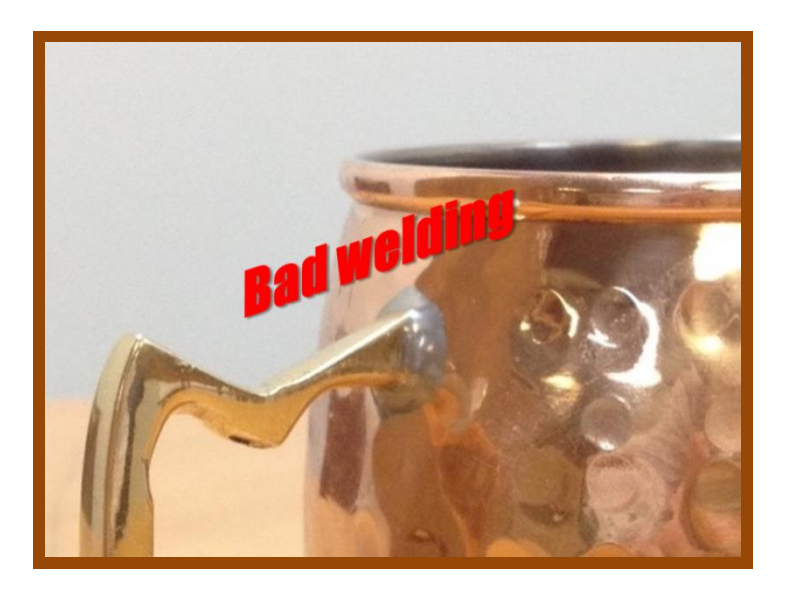
Why select our Moscow Mule Mug?

When shopping for Moscow Mule Mugs, you'll find that the market is flooded with products of inferior quality. Imitation mugs are usually made of stainless steel with copper plating, which defeats the purpose of having a traditional solid copper Moscow Mule Mug. A legitimate solid copper mug keeps your drink cooler longer. A copper plated mug does not. Stay away from stainless steel! Knockoffs are usually made with paltry materials that dent easily, and are prone to discoloration and tarnishing. Cheap imitations will often have poor and improper welding, which makes for a substandard product. Low-grade welding is not only visually unappealing, it compromises the structural integrity of the vessel. Why settle for a mug that will inevitably become useless?